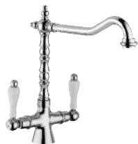
Cucina Classico p.44