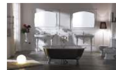
Impero Style p.52