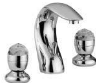
Perisa Crystal p.30