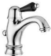
Harmony Crystal p.26