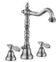
Praga Crystal p.34